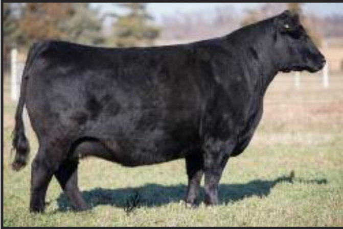
Coleman Everelda Entense 7101 – Dam of Lots 9-11