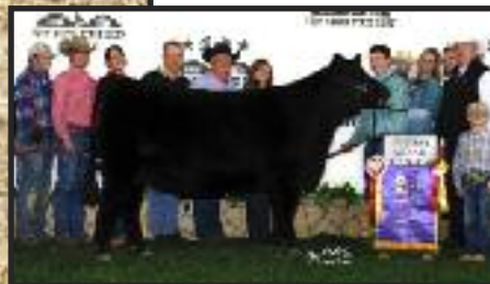
Dam of Lot 5